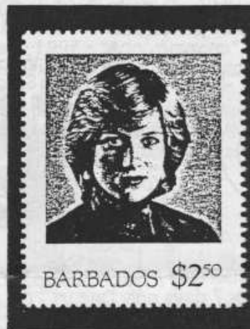
Diana, Princess of Wales 1961 - 1997

(As depicted on one of a set of stamps issued 01 July 1982 from Barbados for her 21st birthday)