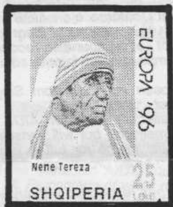
Mother Teresa 1910 - 1997 (As depicted on a stamp issued in 1996 from her motherland, Albania)

"When you look at someone who is dying, you are looking at someone who is closest to God."