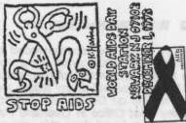
Fig. 4 WAD Newark, NJ

Of the 98 mailings to the various reported stations, 76 were received back and were either protected or in good shape even though they were not returned protected. Of the remaining stations, 14 were written to twice and 6 had to be written to 3 times. These were stations that were either slow in getting the returns back or they came back unprotected and as a result, double canceled, killer canceled, bar coded, etc.