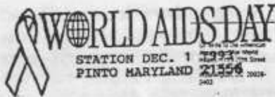
Fig.1 WAD Generic Cancel used nationwide