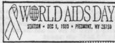
Fig. 5 WAD 1993 Boxed Generic Cancel

first request. Wrong again! On May 03, 1994, I received 2 of the envelopes that I had sent to UCLA Station in California.