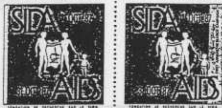
Fig. 1 shows "First Annual Research Campaign" label.

In this issue we take a look at three different AIDS Cinderella issues from three different countries. First we look at our most recent find which we came across during our trip earlier this month to Ottawa, at Orapex '95. These were issued out of Toronto back in 1987 as part of a fundraising effort which ran during the month of October and was to be the first of an annual research campaign fund raiser. No specific fee or price was set, but it was suggested that a donation be made in return for the "labels" (stamps). These may be the earliest known from Canada. If anyone has any further information on these we would appreciate hearing from you.