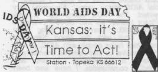
Fig. 3 WAD 1993 Kansas

What was the end result? Although Munice, Indiana, and Plainfield, Indiana, had applied for the cancel, they were not participating. I also never heard ANYTHING from Esmond, RI, nor Providence, RI, but instead I received two cancels from Smithfield, RI, a postal station that I had never written.