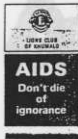
Fig. 3 shows the Lions Club of Khumalo, Zimbabwe, "seal" that was used as an AIDS awareness campaign in that country.