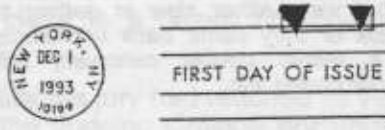
Fig. 2 WAD 1993 New York, NY